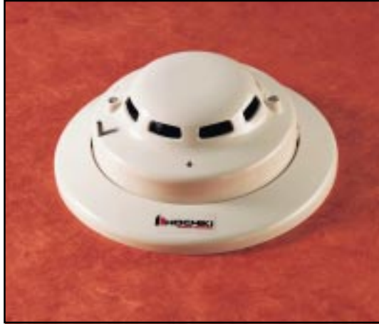
Shown with Trim Ring.